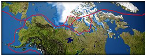
Figure 3: The Northwest Passage

Another area of potential conflict is the status of the Northwest Passage. Canada considers the Northwest Passage as internal waters, while many countries maintain it consists of international straits allowing free transit passage. 17