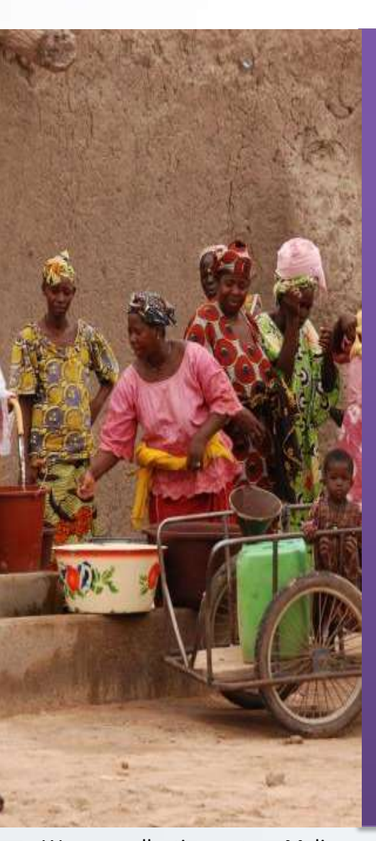
Women collecting water - Mali